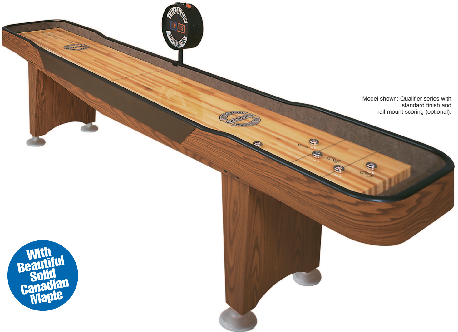
Model shown: Qualifier series with standard finish and rail mount scoring (optional).